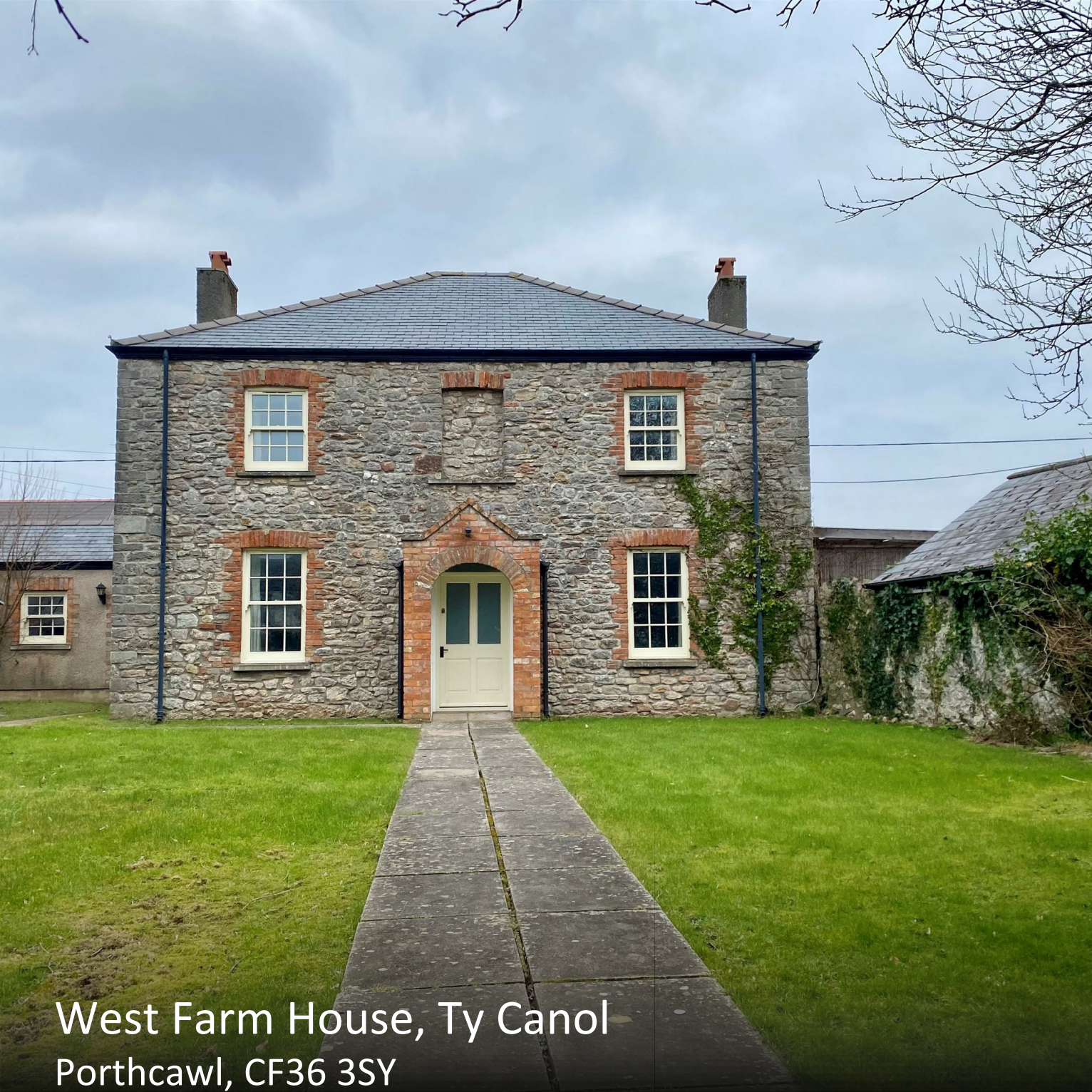
West Farm House, Ty Canol Porthcawl, CF36 3SY